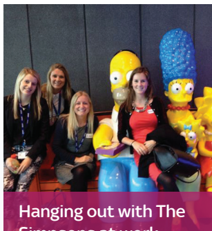
Simpsons at work