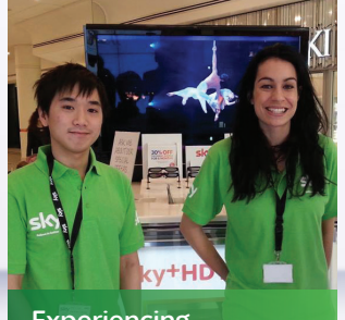
Experiencing another side of Sky