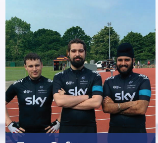
Team Software Engineering Academy

"The best thing about my job? It's different every day."